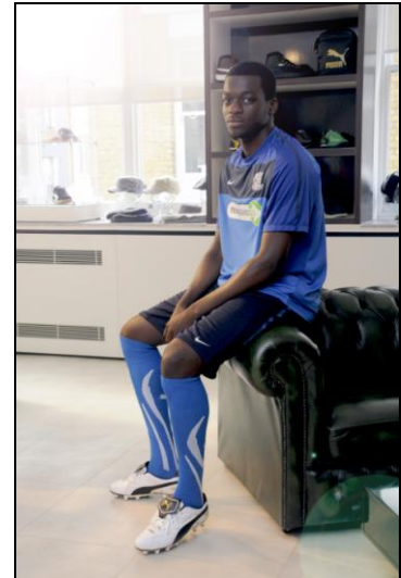
Some of our previous and current schoolboy and full-time professional footballers – a product of the international known Pro Touch Soccer Academy.